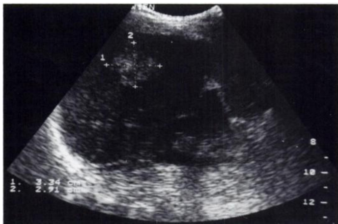
FIGURE 1. Sonographic finding indicates the hyperechoic liver lesion suspicious of a hemangioma.

Despite the biochemical suspicion of a metastatic carcinoid tumor, CT also suggested a liver hemangioma in accordance with the sonographic finding, as the lesion showed the hypervascularization with nodular peripheral enhancement (Fig. 2). Receptor-