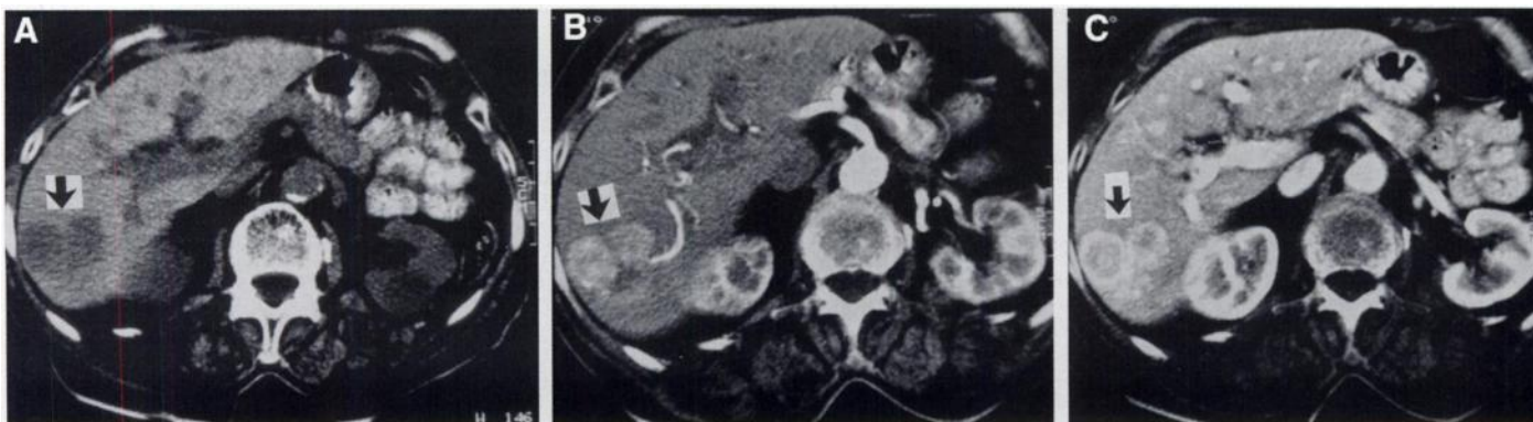
FIGURE 2. A 68-yr-old woman with hepatic carcinoid metastasis. CT scan of the liver shows a hypervascular lesion. The pattern of peripheral enhancement was suggestive for a hemangioma rather than a metastasis. (A) Native CT. (B) Contrast-enhanced CT, arterial phase. (C) Contrast-enhanced CT, portal venous phase.