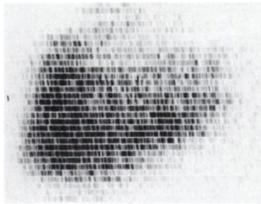
FIG. 2. Spleen scintigraph following a 6-month course of MOPP therapy (4/23/74).